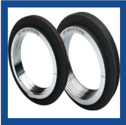
Saw Tooth / Metric Buttress Thread Plug Gauges