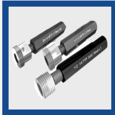
Thread Plug Gauge