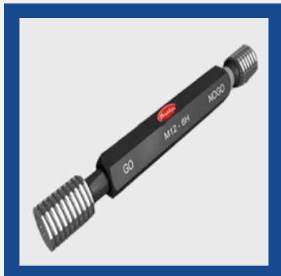
Metric Taper Gauge