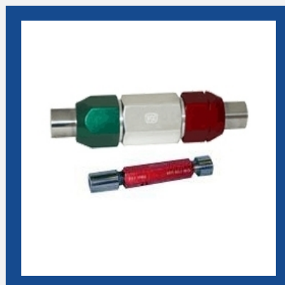
Plain Plug Gauges