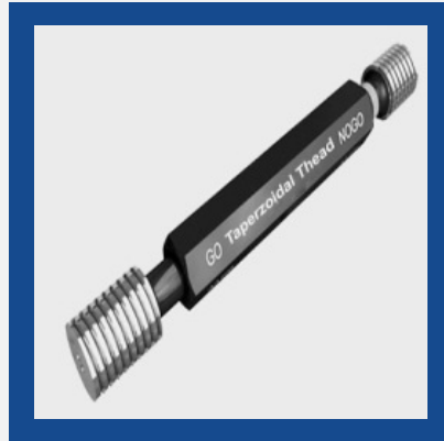
Trapezoidal Thread Plug Gauges