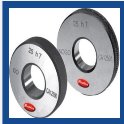
Plain Ring Gauge