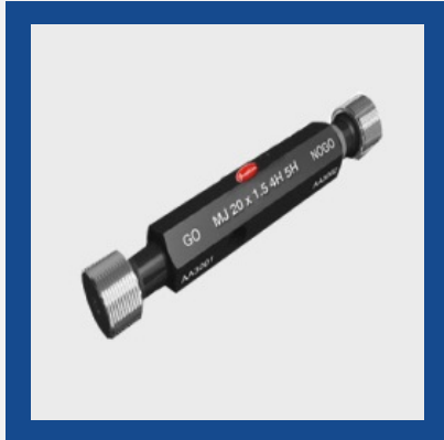
Thread Plug Gauges