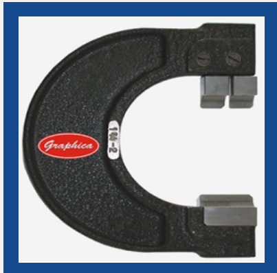
Precision Snap Gauges