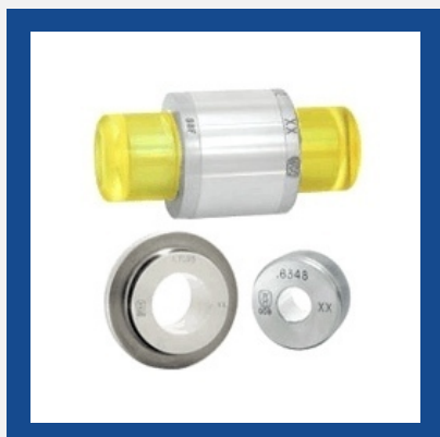
Industrial Setting Master