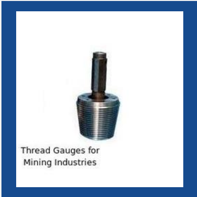
Thread Gauges for Mining Industries