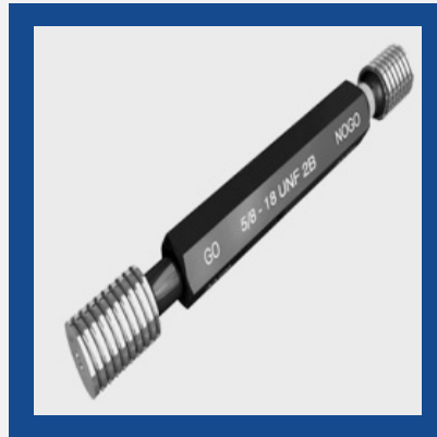
Thread Ring Gauge