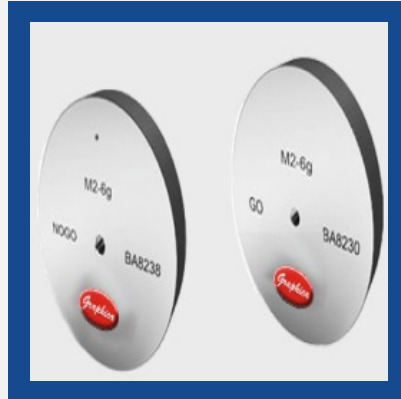
ISO Metric Thread Ring Gauges